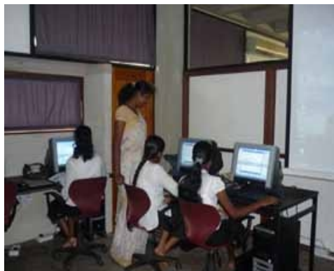
Teachers are in their lessons