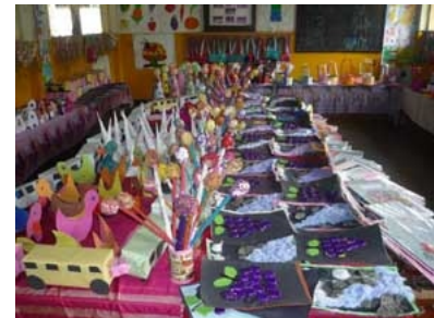
On exhibiting children creations

The world children day was celebrated on 01 st Of October with the participation of all the children of the pre-school and every child was given a small gift pack and the film "ICE AGE" was shown on the day.