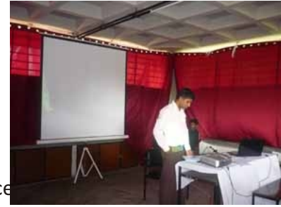
In giving a lecture about career guidance

A special career guidance workshop was organized by the NAITA for the students who are studying in the computer unit and the English unit. 85 students attended this and the District Manager of the NAITA in the Galle district, the District Coordinator and a special invited lecturer for carrier guidance were present at the workshop.