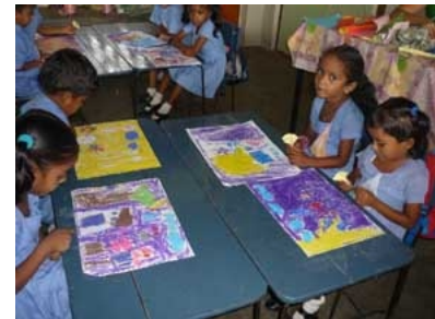
In drawing their thoughts

Pre-School painting competition was held with the participation of all pre-school children with Katuwila branch. This was organized and sponsored by the Bank of Ceylon, Sri Lanka.