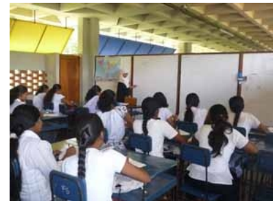
With the hope of learning a new language

The Tamil Language training program was commenced successfully for school leavers, 52 student attended at the beginning, and has been divided into two groups,